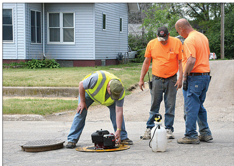
Pictured above, crews hook up the equipment to run the smoke testing. Below, the smoke rises from a house in the way it should if things are properly vented.