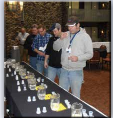
Preliminary sampling at the 2013 Water Taste Test.