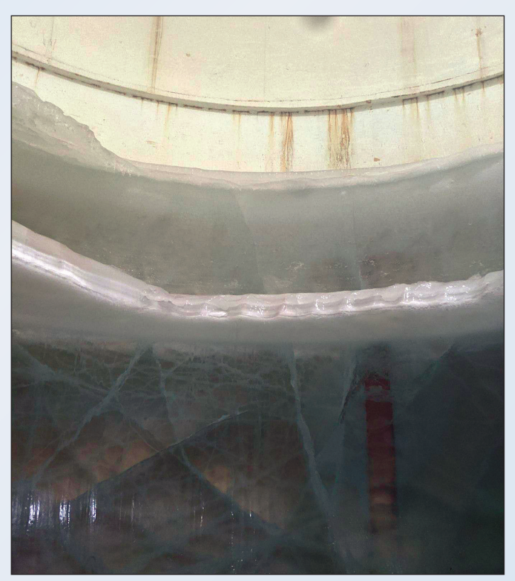
Ice build-up in tower.

Another area of concern is the riser pipe which leads to the tower bowl. If there is not enough water movement through the riser pipe, there is a chance it will freeze